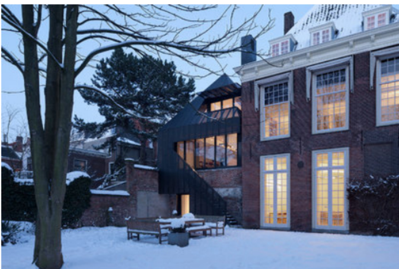
Tuesday | 26 March | 2013 | Netherlands | Emiel Lamers

The primary form of this annex is traditional, while the facade and roof coverings are contemporary, finished in black, perforated aluminium. A steel staircase outside, which runs beautifully along the historical masonry facade, leads to a bright kitchen on the first floor. This is used by the eleven students for whom luxury rooms with private bathrooms have been realized in the front house. Under the roof ridge directly above the kitchen, Mirck created a freely suspended seating area with connecting terrace. Through a glass atrium one finally arrives in the front building once more, where the students' rooms are spread over three storeys. Currently, the architects are still working on a special light wall, which will ensure that the contemporary intervention is not only visible from the backyard, but from inside the atrium as well.